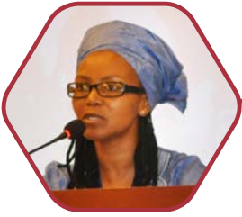
Ms. Treasure Maphanga, a special representative from the Department of Trade and Industry, African Union Commission