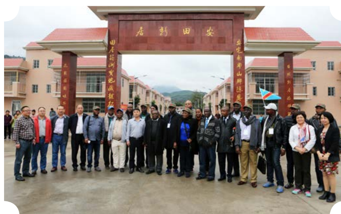
The participants of the Seminar on High-Level Exchanges and Cooperation for Ministers from the Democratic Republic of the Congo inspected the rural relocation project in Antian Village, Liannan County, Qingyuan, Guangdong Province.