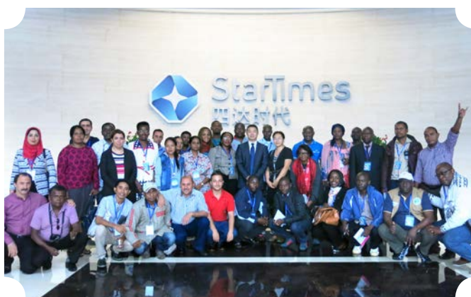
The participants of the Seminar on Integrated Rural and Urban Development and Poverty Reduction for Asian Countries visited Beijing StarTimes Company.