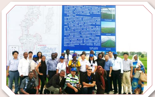
An inspection of the high-standard farmland construction project in Hefeng Town, Lishui District, Nanjing

The China-Africa High Level Experience Sharing Program has been successfully held for eight consecutive years since 2008 , and it has become an important platform for exchanging ideas on development issues between China and Africa and for promoting South-South cooperation.