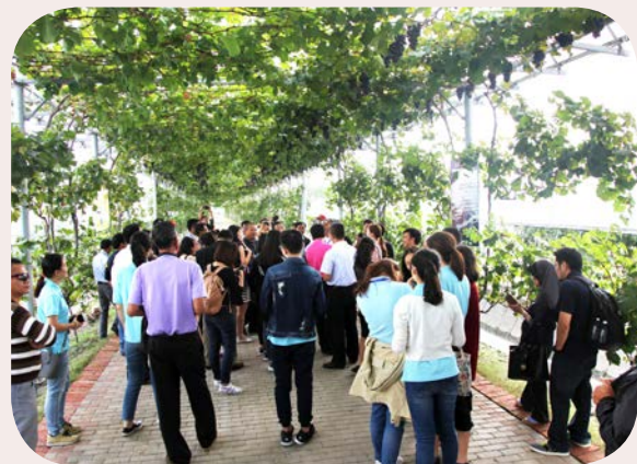
An inspection of the Shiquan Grape Specialized Cooperative in Shanghai