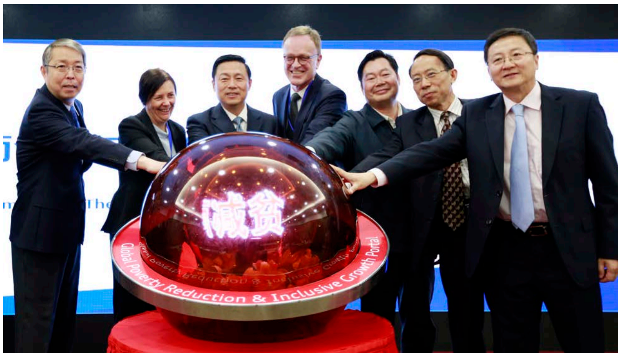
The 2016 China Poverty Reduction International Forum & Launching Ceremony of Global Poverty Reduction and Inclusive Growth Portal is held in Beijing.