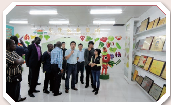
An inspection of the organic vegetable industry of Guangdong Dongsheng Agricultural Group