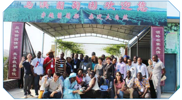
The Seminar on Development-oriented Poverty Alleviation Policy and Practice for Officials from Francophone Africa inspected Hengshun Group in Zhenjiang, Jiangsu Province.