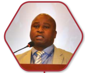
Mr. Mcebisi Skwatsha, Deputy Minister of Rural Development and Land Reform of South Africa