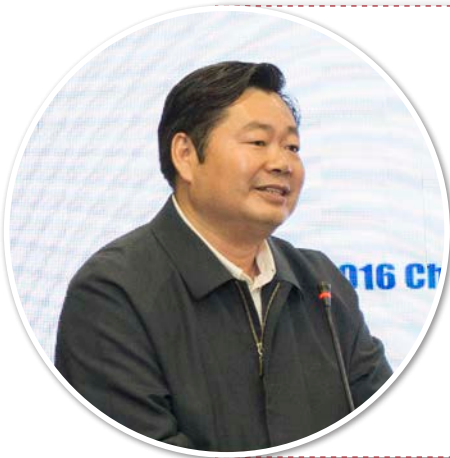
Mr. Hong Tianyun, Vice Minister of LGOP

Vice Minister of LGOP Mr. Hong Tianyun noted that, as a common topic all over the world, poverty reduction concerns the sustainable development of human beings. China has achieved the poverty reduction target under UN MDGs beforehand and reduced the poor population by more than 700 million, which is the largest in the world. LGOP shall make full use of all kinds of platforms and opportunities to increase exchanges of poverty reduction experience with African, Latin American and other Asian countries and tell a good story of China's poverty reduction while drawing upon more success stories and best practices by advancing international cooperation on poverty reduction.