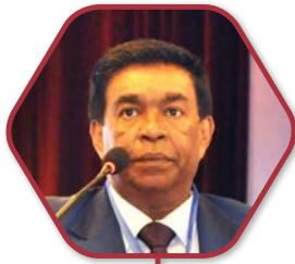
Mr. Prithvirajsing Roopun, Minister of Social Integration and Economic Empowerment of Mauritius