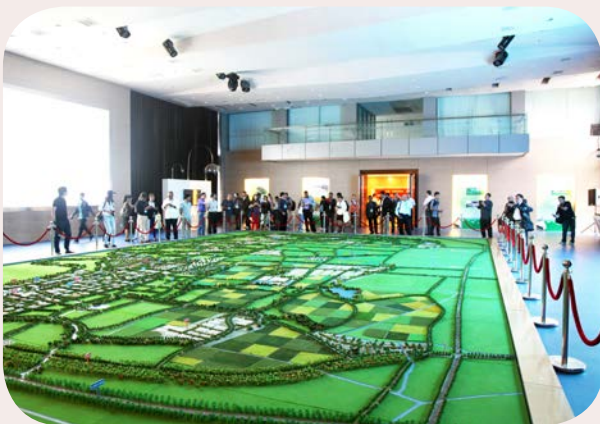
An inspection of the modern agricultural park in Shanghai

During the event, the participants went to Jinshan District, Shanghai for an inspection of the project sites, including Exotic Plant, Jinshan District Vegetables R&D Center (an intelligent agriculture base) and Shiquan Grape Specialized Cooperative. Moreover, they also held talks with the villagers and cadres.