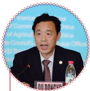
Speech by Mr. Qu Dongyu, Vice Minister of Agriculture of China