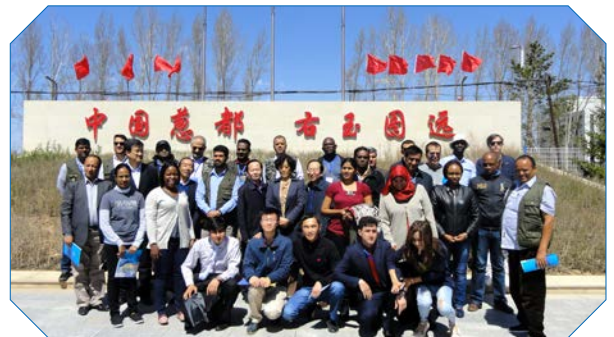
The participants of the Seminar on Inclusive Growth and Rural Sustainable Poverty Reduction in the Developing Countries visited Youyu County (County of Onions), Shanxi Province.