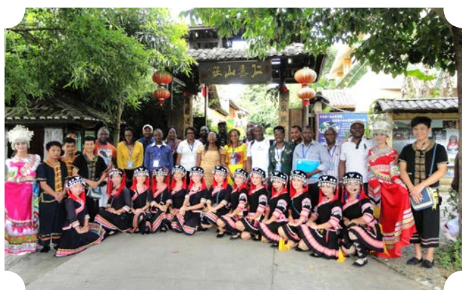
The participants of the Seminar on Cameroon Poverty Reduction Experience Sharing inspected the tourism poverty reduction project in Rensou Villa, Bama County, Hechi of Guangxi Province.