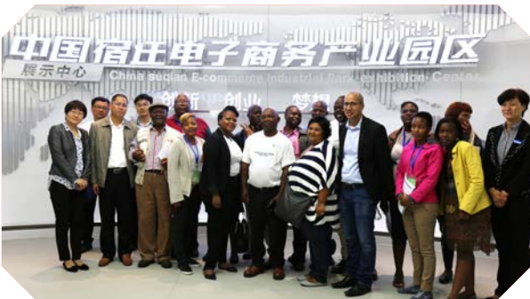
The participants of "From Policy to Practice: Seminar on Promoting Rural Enterprises Development for More Inclusive Growth" inspected the Suqian E-commerce Industrial Park in Jiangsu.