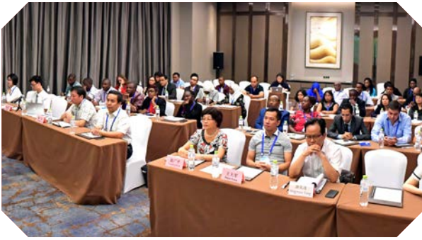
The participants of the Seminar on Rural Development and Poverty Reduction for the Developing Countries attended the class.